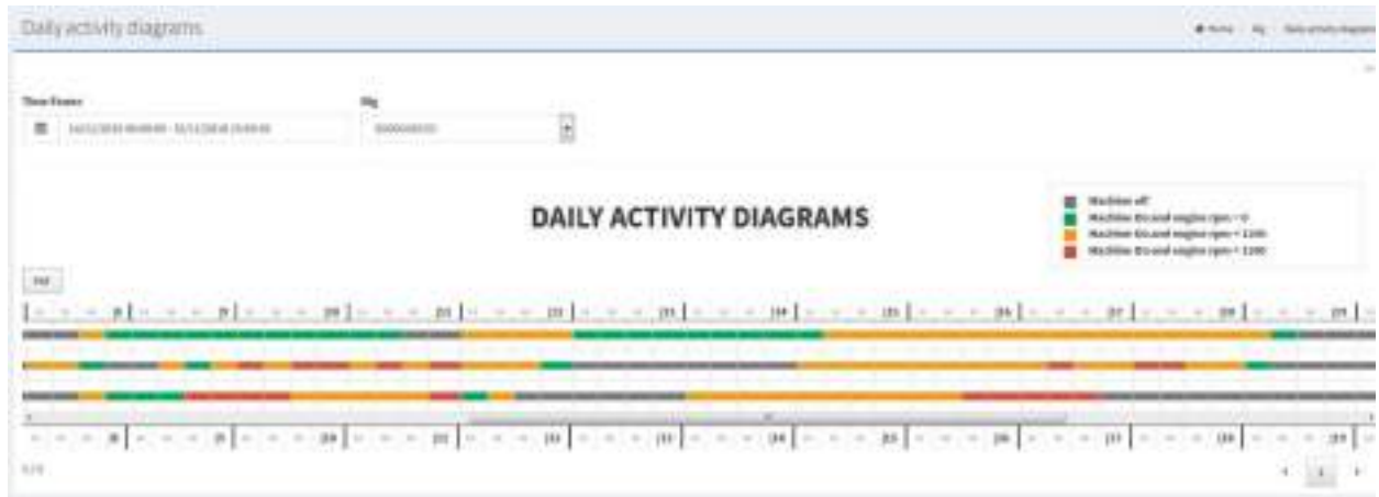
FleetMaster example of day activity diagram